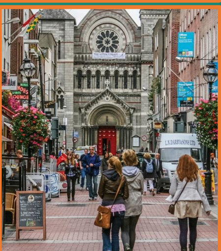
This is an exclusive travel program presented by InterTrav Corporation