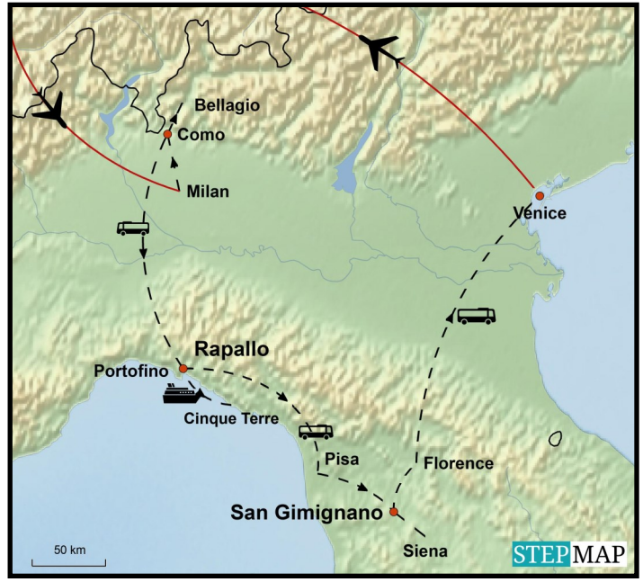
Thurs., Oct. 31 – ITALIAN RIVIERA

After breakfast we'll set out with our all-day pass, using the rails, buses and trails to explore the villages of Cinque Terre. The Italian Riviera is not short of rugged coastline or romantic towns and villages, but the five fishing communities of the Cinque Terre are its most iconic highlight. Tucked away in a particularly mountainous kink at the eastern end of the Italian Riviera, the villages of the Cinque Terre were shaped by their profound isolation. Set amid some of the most dramatic coastal scenery on the planet, these beautiful, colorful towns can bolster the most jaded of spirits. Sinuous paths traverse seemingly impregnable cliff sides, and a 19th-century railway line that's cut through a series of coastal tunnels moves people from village to village. Cars have been banned within the villages for more than a decade. The five villages are no longer the isolated hamlets they once were, but there's still a feeling of authenticity here, with few roads, perfectly preserved architecture and a network of stunning coastal and mountain trails. (B)