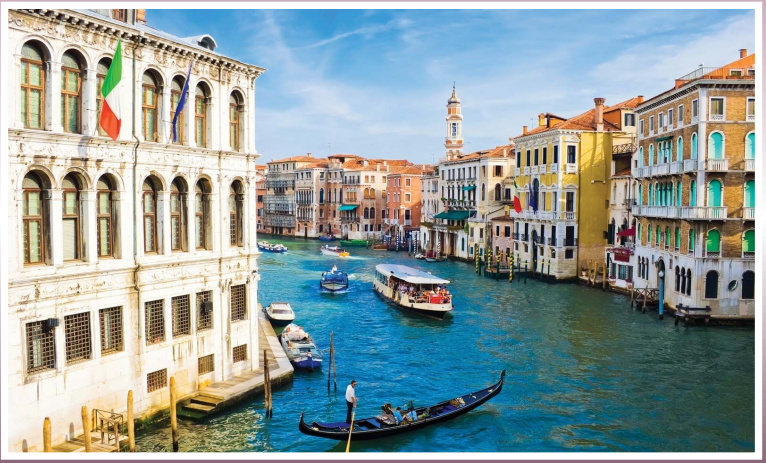
This is an exclusive travel program presented by InterTrav Corporation ~ visit www.grouptripsandtravel.com