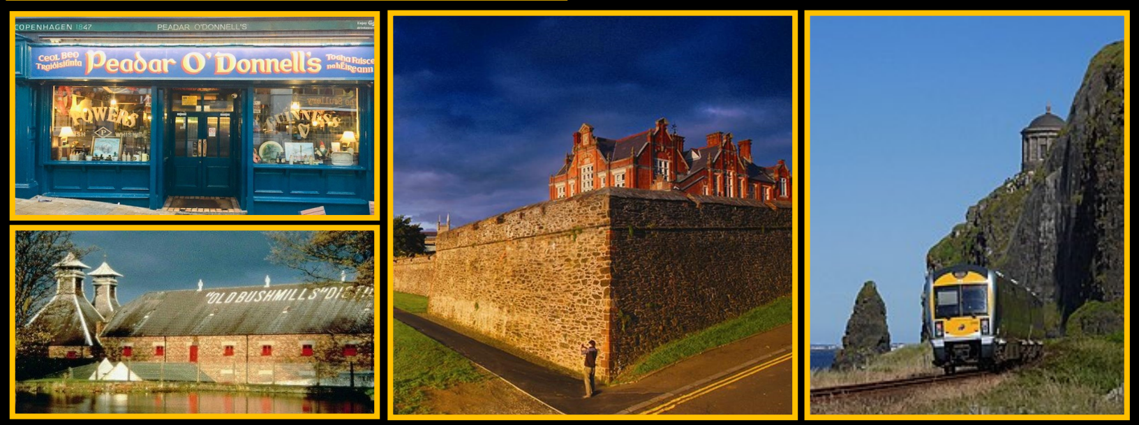
This is an exclusive travel program presented by G&W Irish Tours and InterTrav Corporation