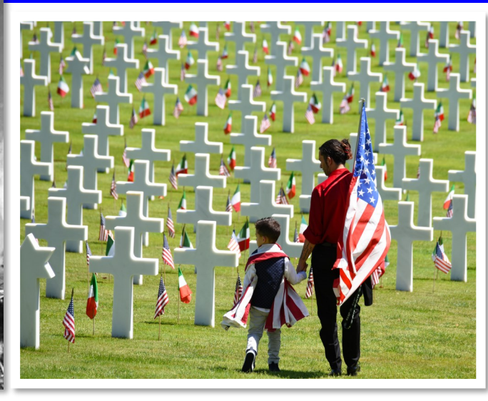
This is an exclusive travel program presented by History Colorado and InterTrav Corporation

10th Mountain Division, and end along the shores of beautiful Lake Garda, where the 10th utilized tunnels to bring down the last German defense line in Italy.